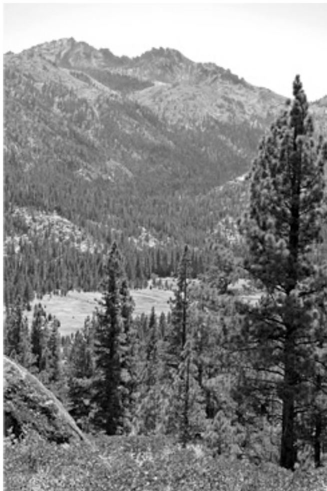
Pleasant Valley and Raymond Peak

The owner has shown good stewardship toward the land with his grazing practices, and we look forward to working with him to resolve this issue in a way that protects both his interests and the public's right to wilderness access.