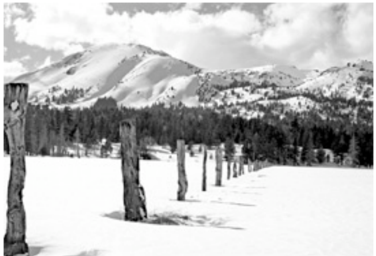
Hope Valley and Red Mountain

Have an adventure this winter. Take time to enjoy the winter environment and experience Hope Valley under a blanket of snow. Follow Edward Abbey's recommendation: "So get out there...ramble yonder and explore the forest... breath deep of that yet sweet and lucid air, sit quietly for awhile and contemplate the precious stillness, that lovely mysterious and awesome space."